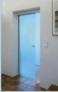
Glass door options also available please call for further details