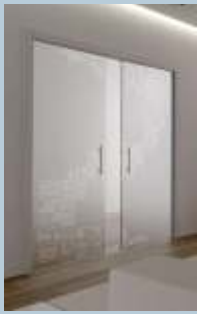
Glass door options also available please call for further details